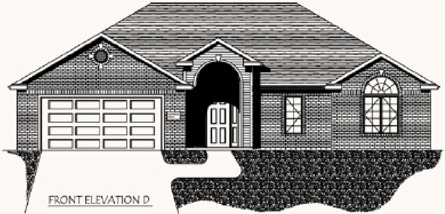
FRONT ELEVATION D

RENDERINGS AND FLOOR PLANS ARE ARTIST'S CONCEPTION OF TYPICAL HOMES AND DO NOT NECESSARILY REPRESENT FINAL PLANS, DIMENSIONS, DESIGNS OR ELEVATIONS. PRICES, PLANS AND SPECIFICATIONS ARE SUBJECT TO CHANGE WITHOUT NOTICE.